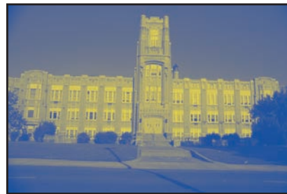
Image with Process Color Blends Navy (C100 M80 Y0 K0) and Yellow (C0 M0 Y85 K12) Applied

On a 4-Color or spot color page, you can create interesting color halftone effects in InDesign. You can replace the shades of black in a photo with one color yielding a one color plus white photo. You can replace the white in a photo with a color and get a black plus one color photo. You can replace both the black and the white with different colors and achieve a color plus color photo.