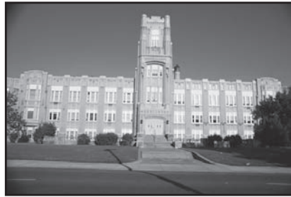
Original Grayscale Image